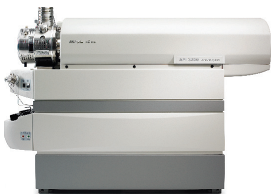
API 3200™LC/MS/MS System

For a limited time, choose from two special offers when you purchase a Planned Maintenance visit for your Applied Biosystems/MDS Analytical Technologies system.* Recognized as “Best in Class” worldwide, AB Global services provides the highest quality support for Applied Biosystems/MDS Analytical Technologies systems. Only our certified Service engineers receive regular factory training on the latest technical developments, repair procedures, software revisions, and application updates.